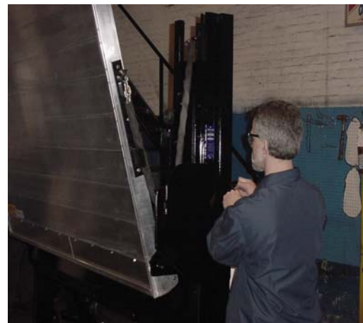
Toggle switch opens/closes the platform